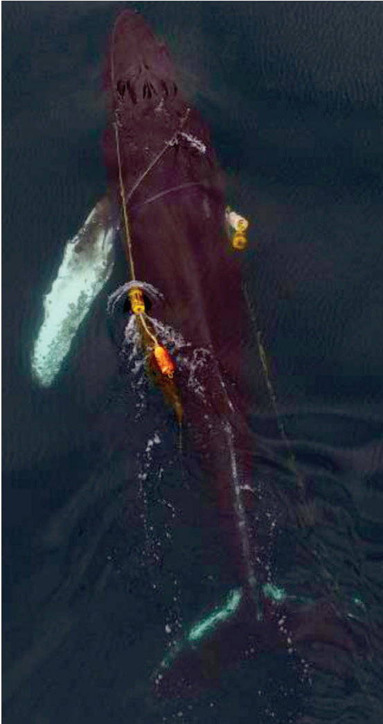
NOAA MMHSRP # 18786

Recommended by the Washington Whale Entanglement Working Group*