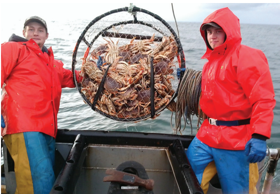
WA Commercial Dungeness Crab Vessel