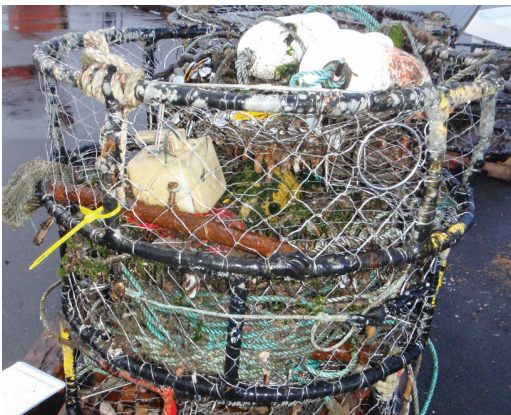
Recovered derelict gear